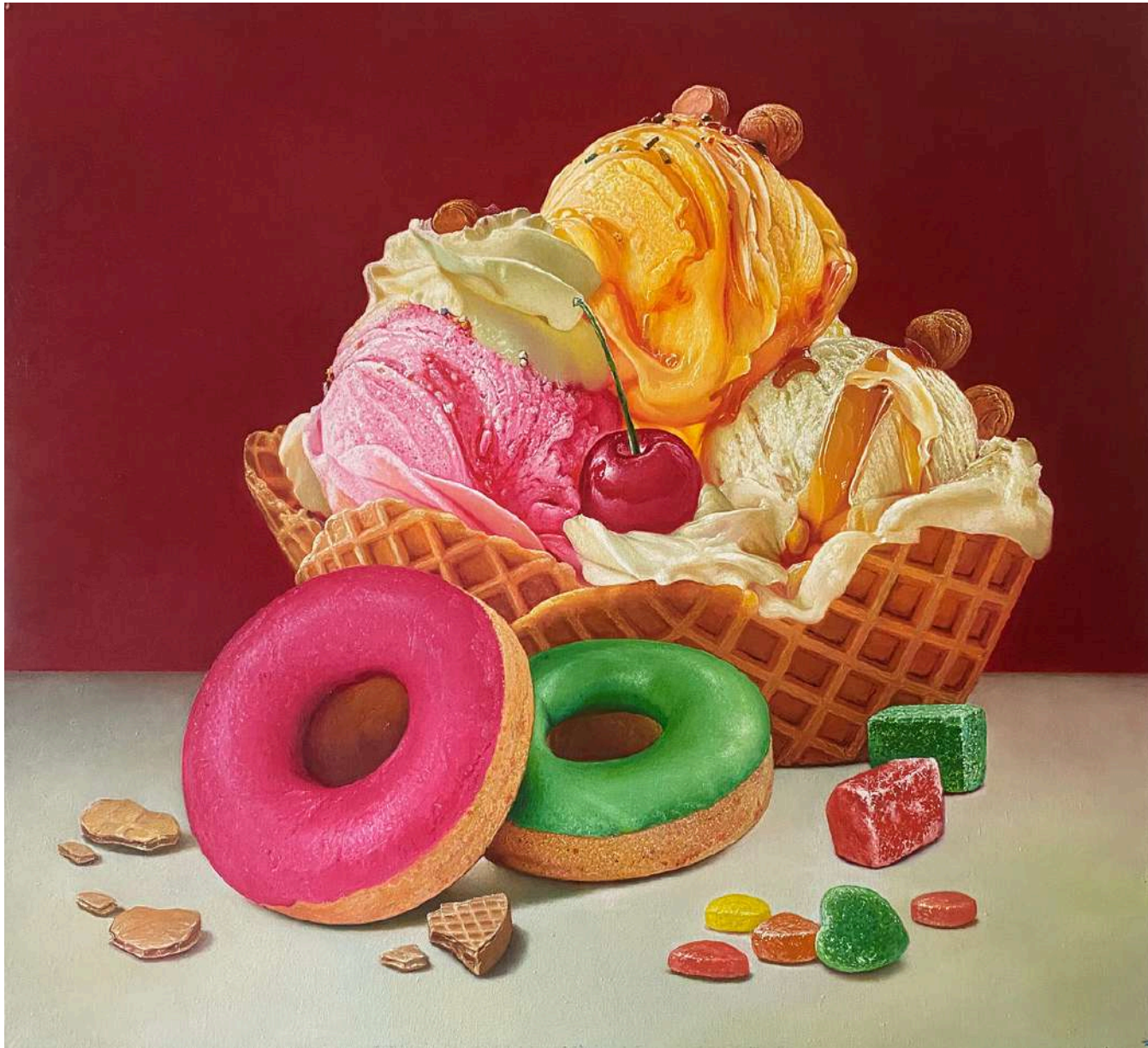
Hadiah Cinta Oil on canvas 80 x 90 cm 2025