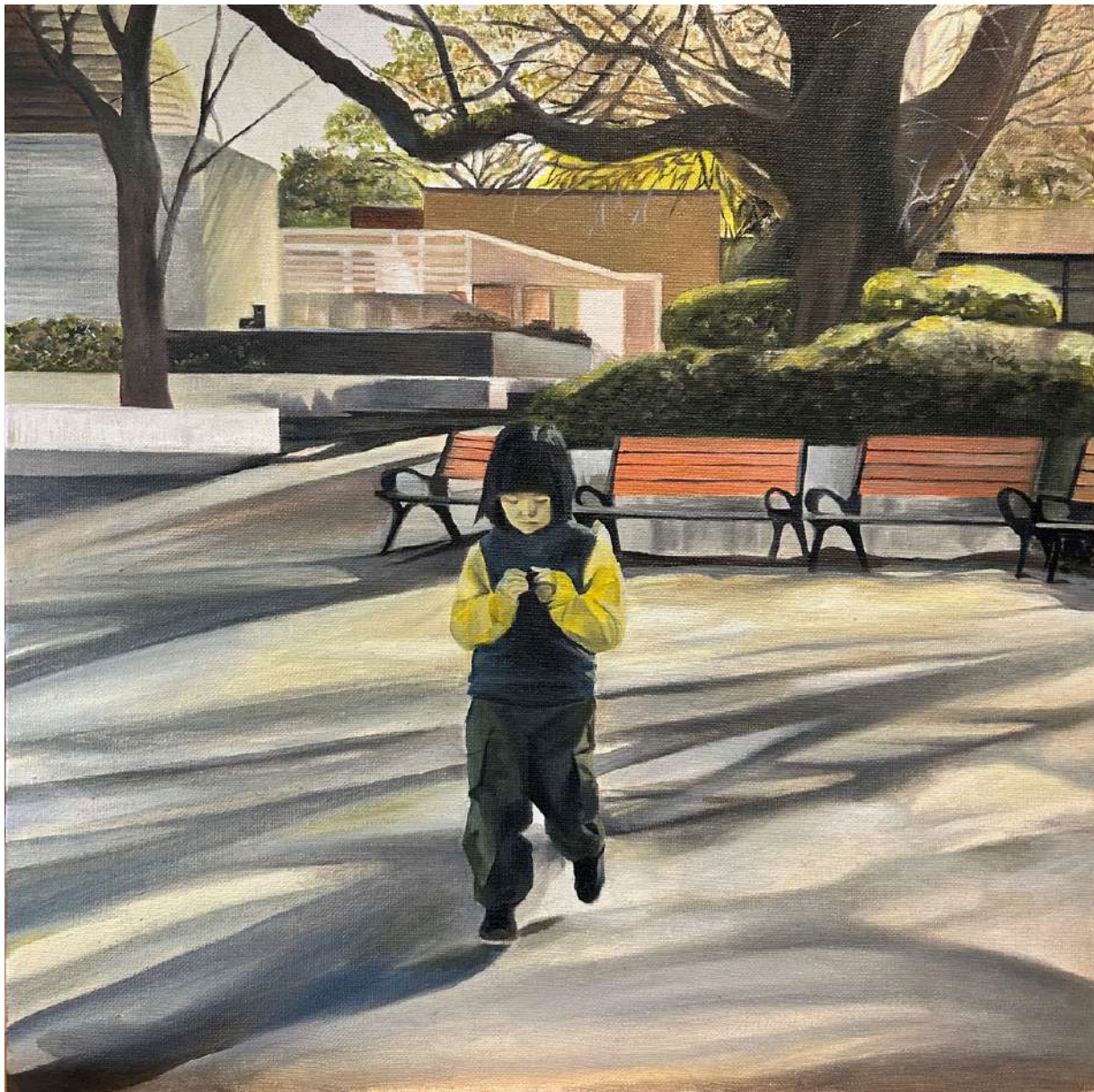
Never Far Oil on canvas 45 x 45 cm 2025