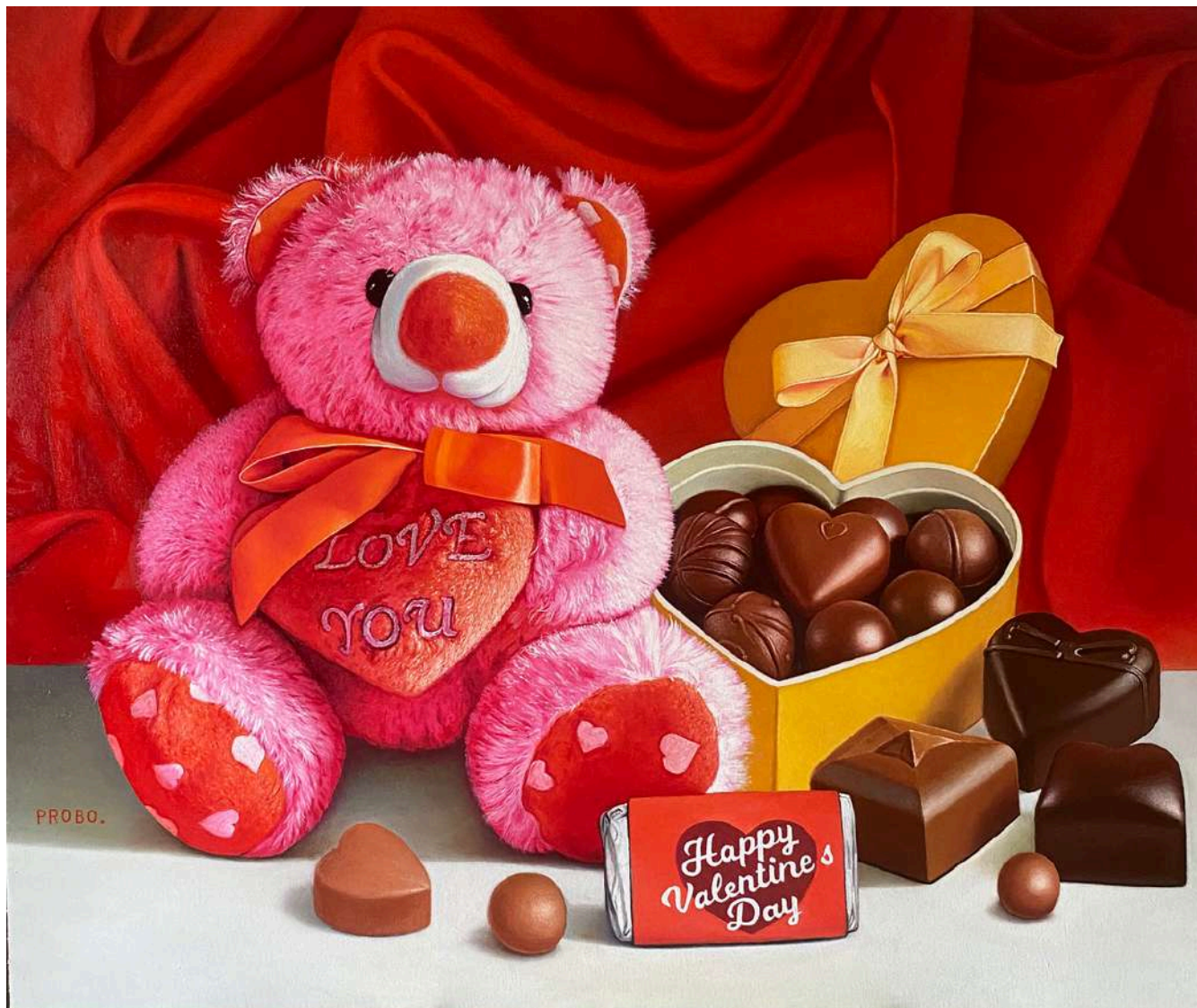
Visual Cinta Oil on canvas 100 x 120 cm 2026