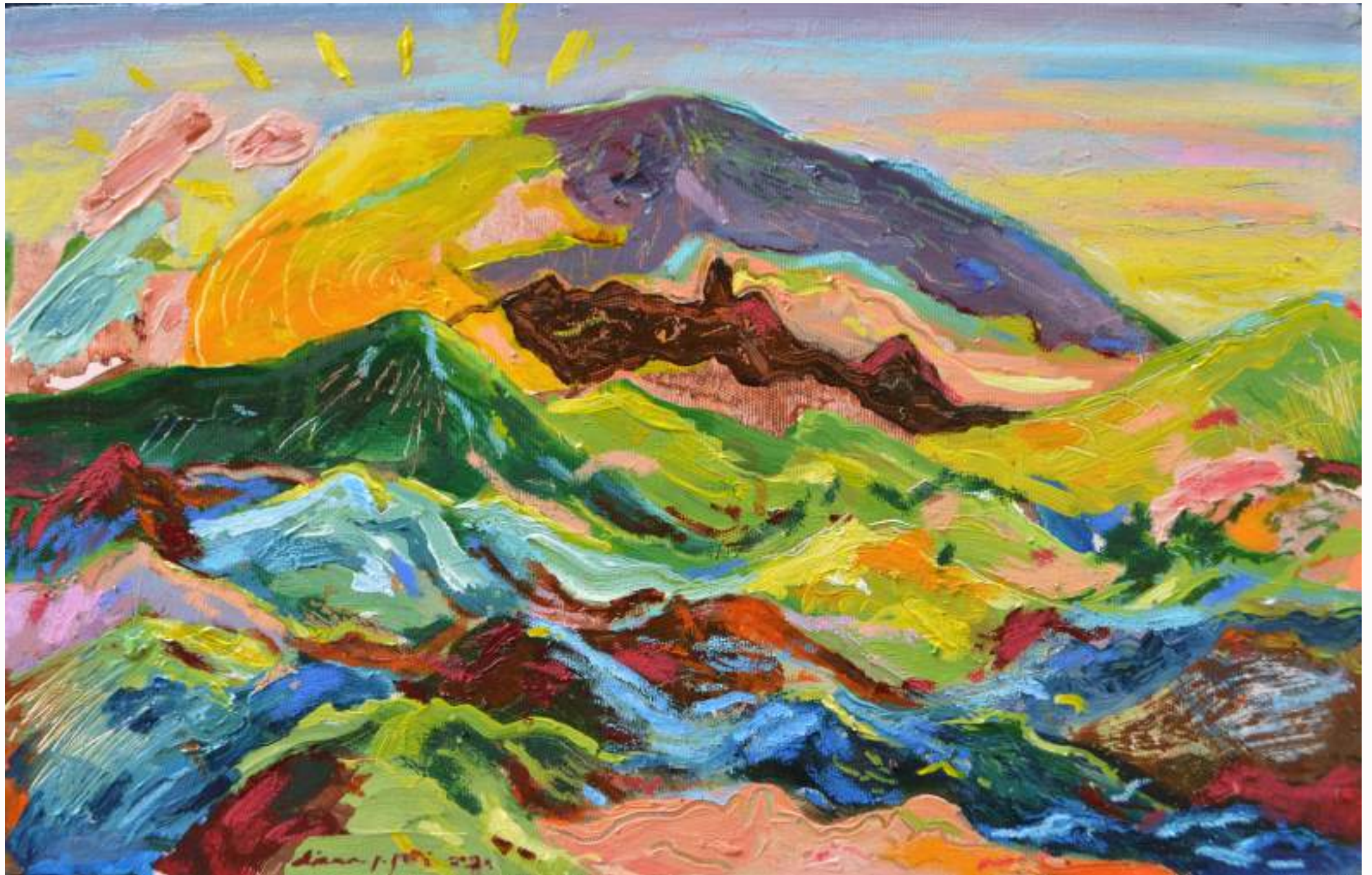
Earth Healing #2 29,7cm x 42cm Acrylic and Oil on Canvas 2020_