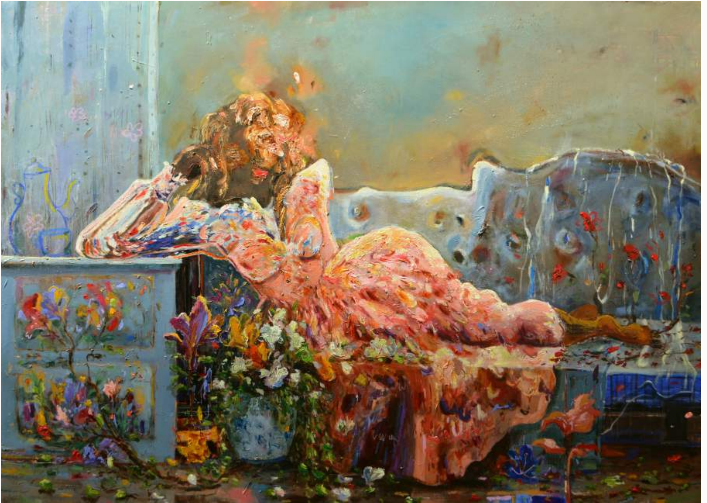
Lady Acrylic and Oil on Canvas 120 cm x 150 cm 2020_