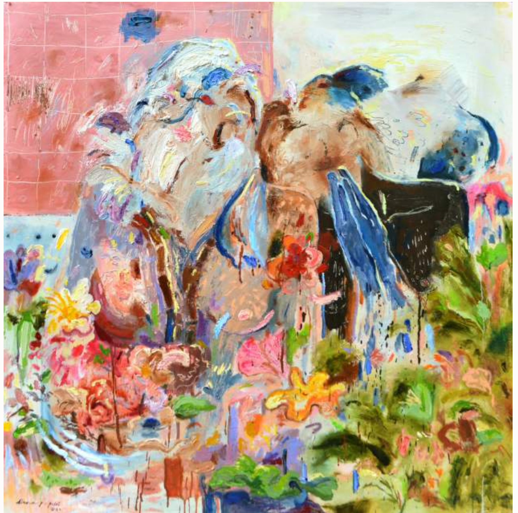
Lean On 80cm x 80cm Oil and Acrylic on Canvas 2020_