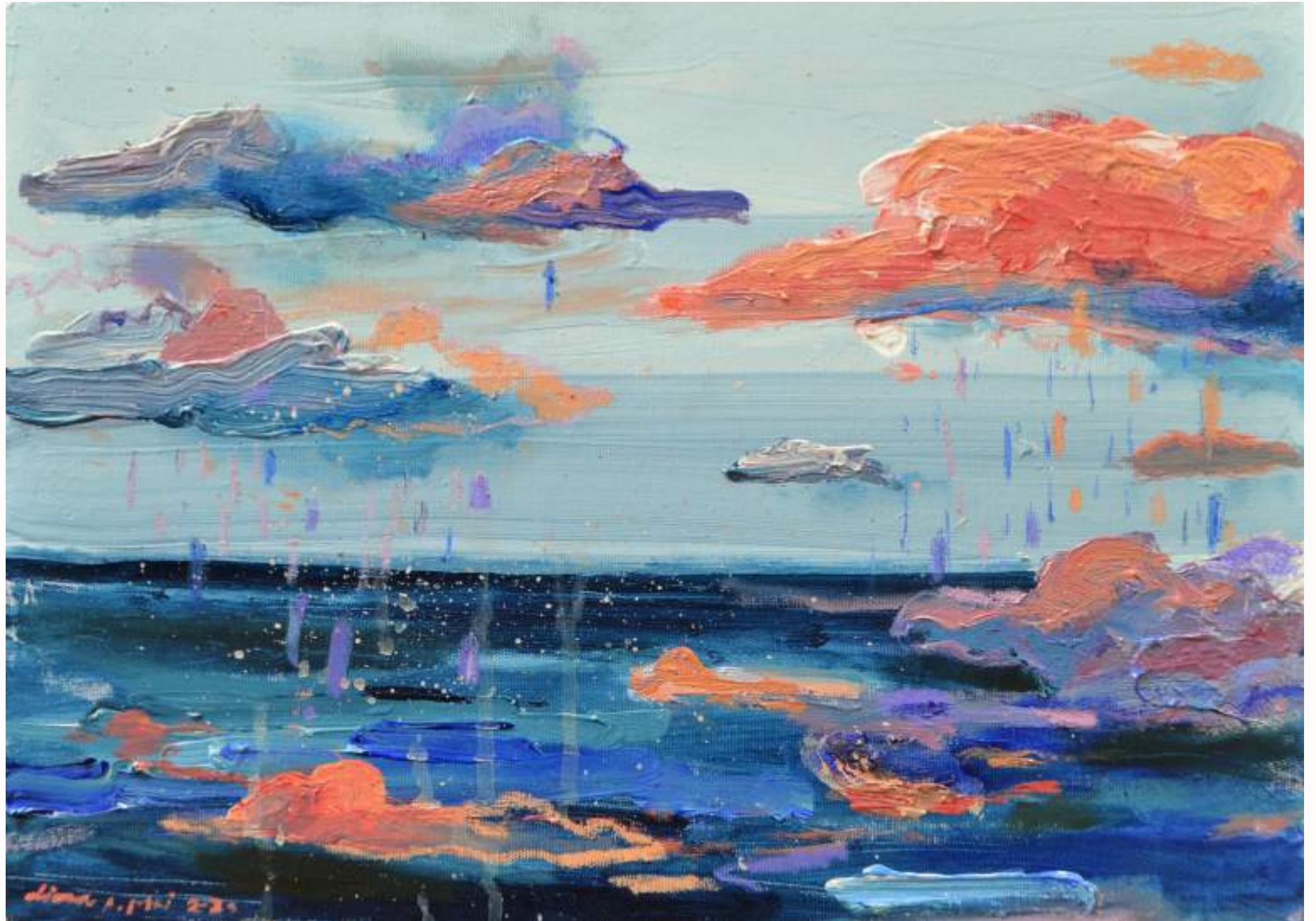
Earth Healing #1 29,7 cm x 42cm Acrylic and Oil on Canvas 2020