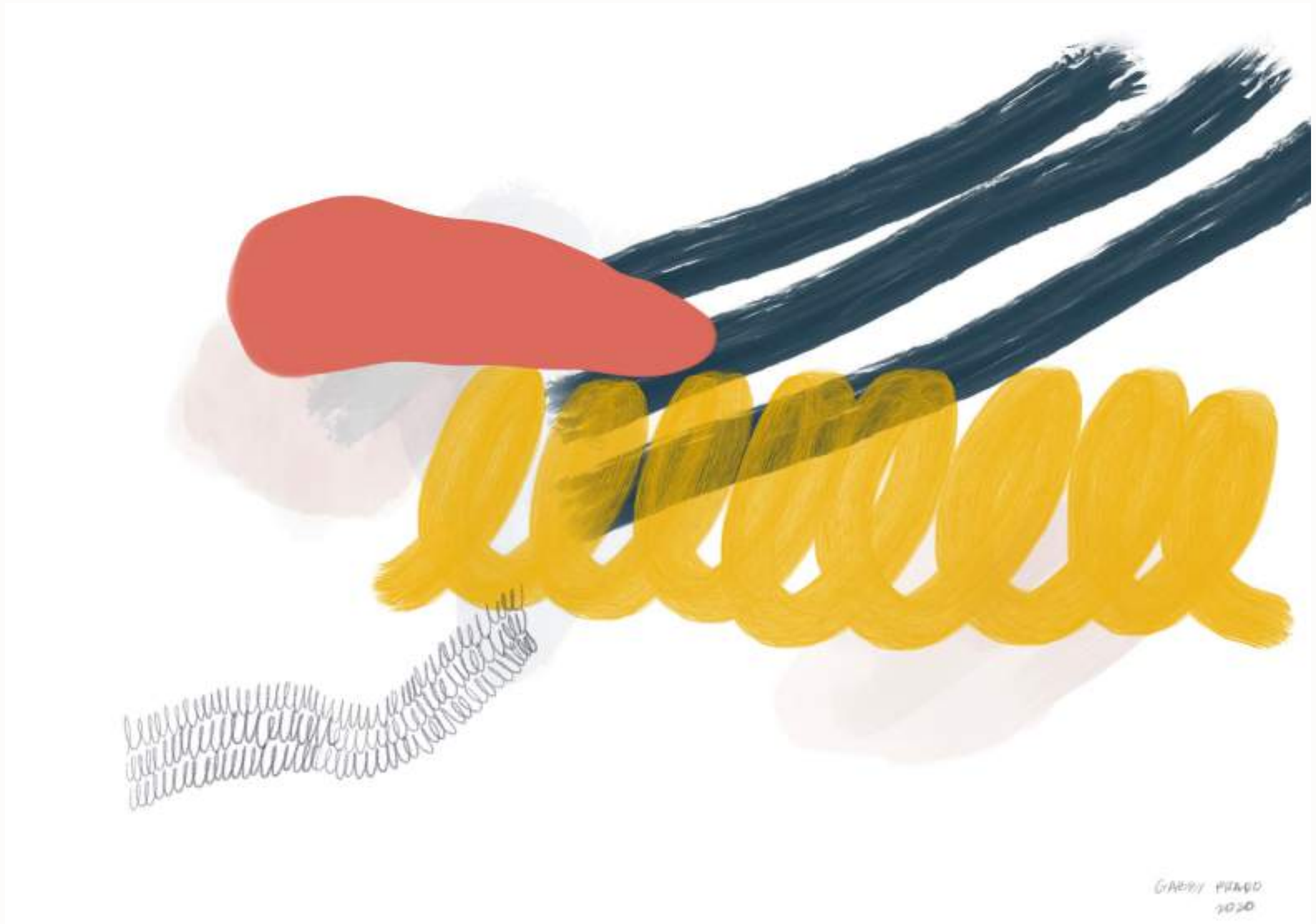
Worst having Lacuna Digital Painting 11.69 x 8.26 inches March 2020