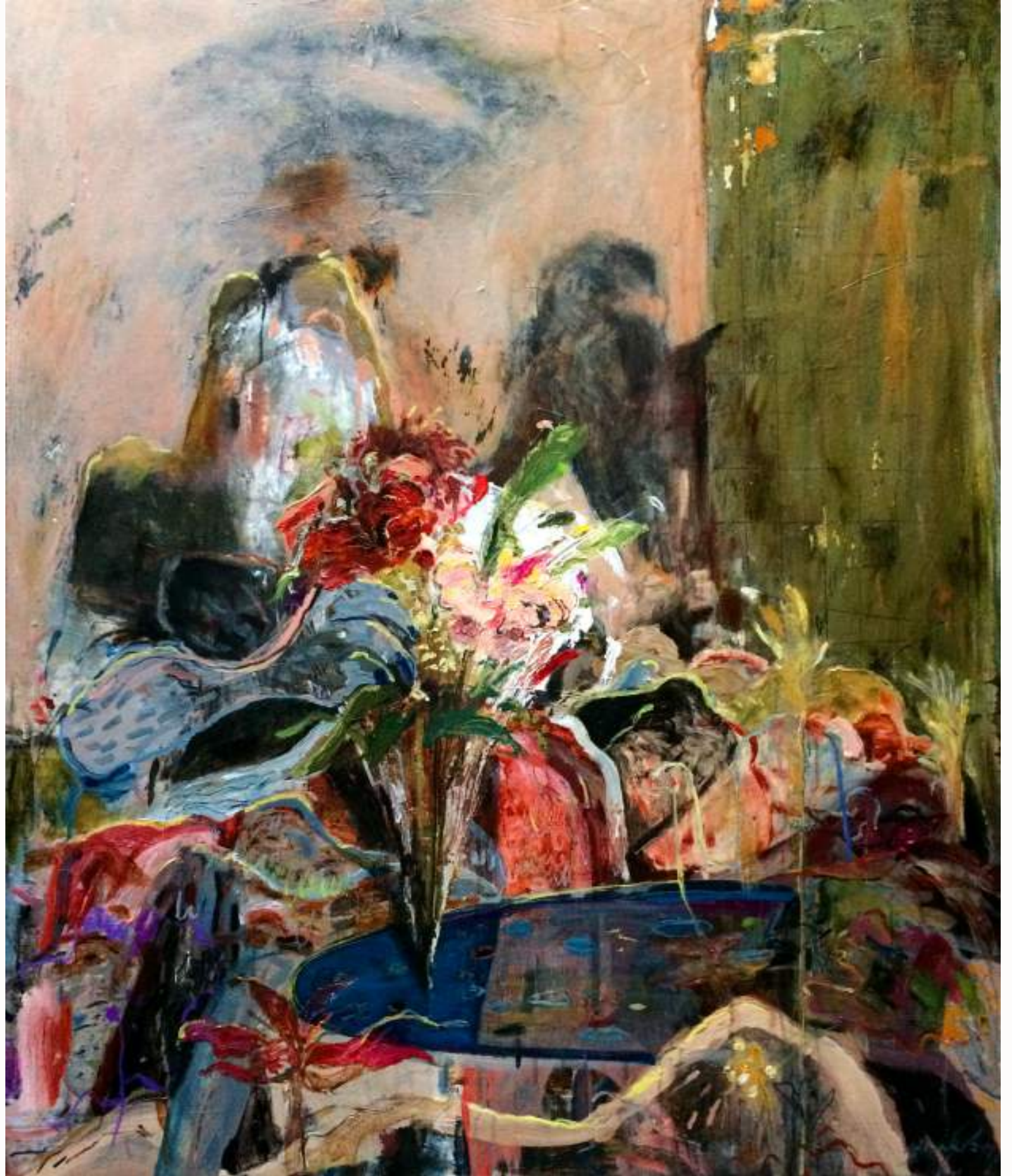
Kembang Desa 100 cm x 120 cm Acrylic on Canvas 2019