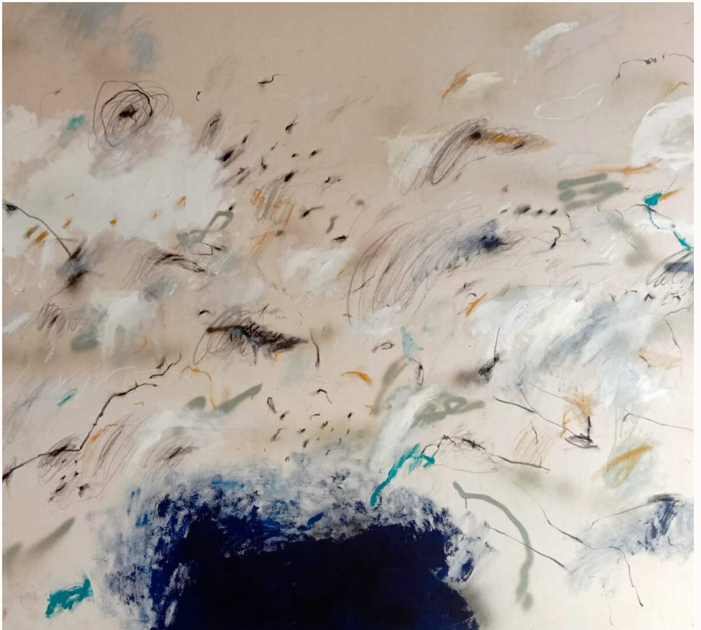
"Destroy" Acrylic, charcoal, pastel and ink on canvas 200x180 cm 2020