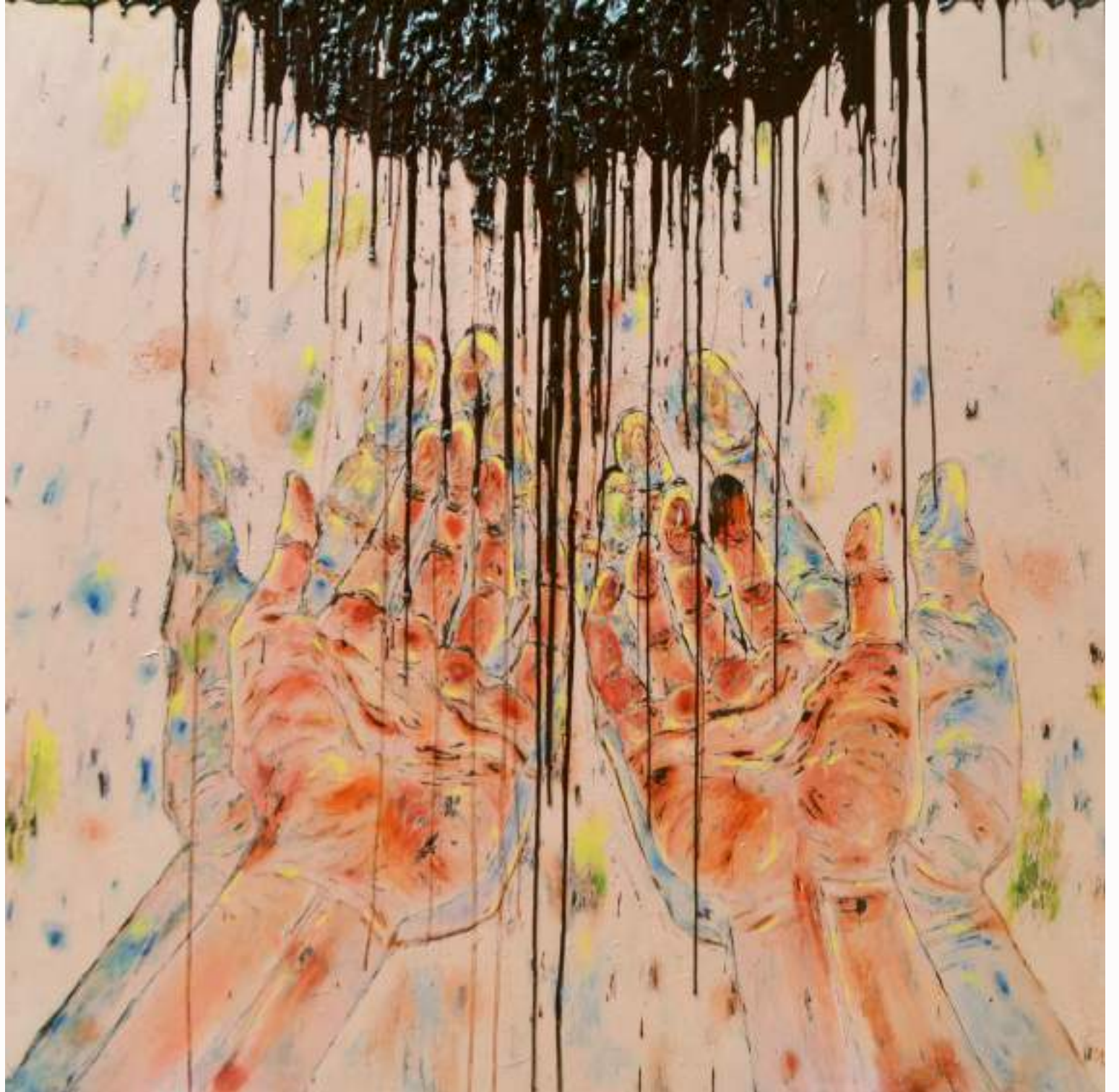
Praying #3 120cm x 120cm acrylic and resin on canvas 2020_