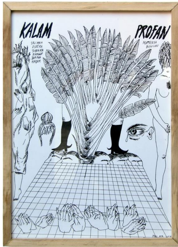
Kalam Profan , 35 x 50 cm, 2016, Drawing pen on paper