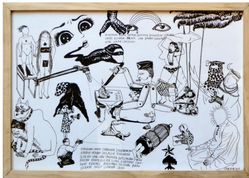
Asal Bapak Senang , 50 x 35cm, 2016, Drawing pen on paper