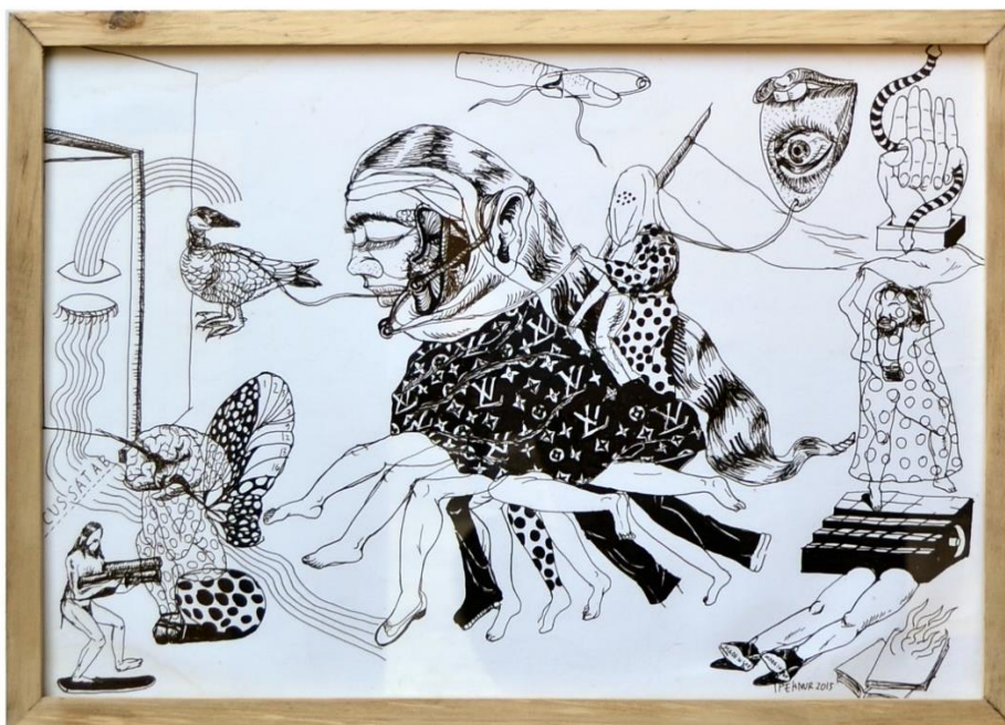
Gerbang Emas , 50 x 35cm, 2016, Drawing pen on paper