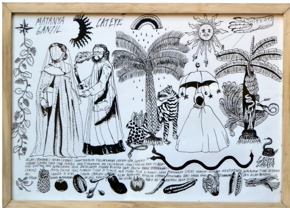
Taman Bidara, 50 x 35cm, 2016, Drawing pen on paper