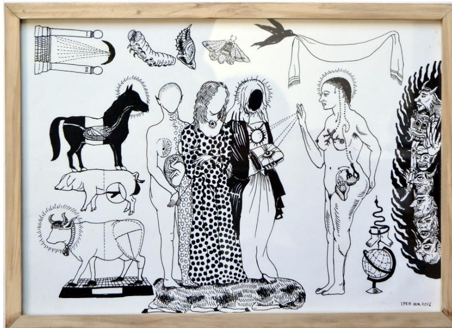
Di Bawah Cahaya Pendar , 35 x 50 cm, 2016, Drawing pen on paper