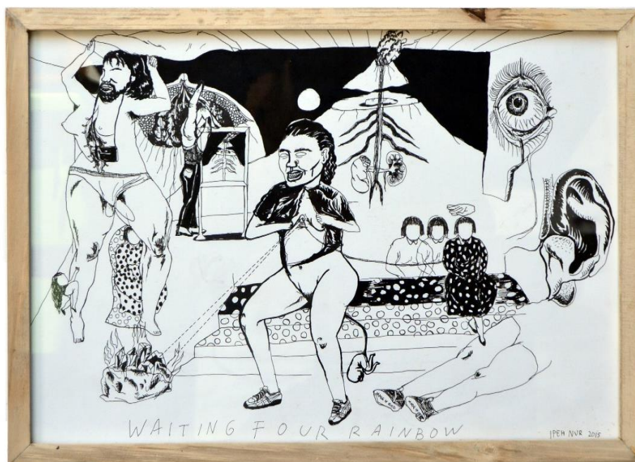
Empat Pelangi , 50 x 35cm, 2016, Drawing pen on paper