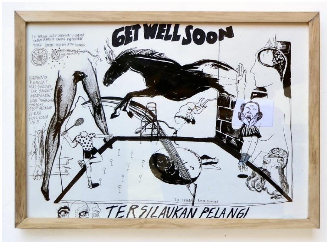
Tersilaukan Pelangi, 35 x 50 cm, 2016, Drawing pen on paper