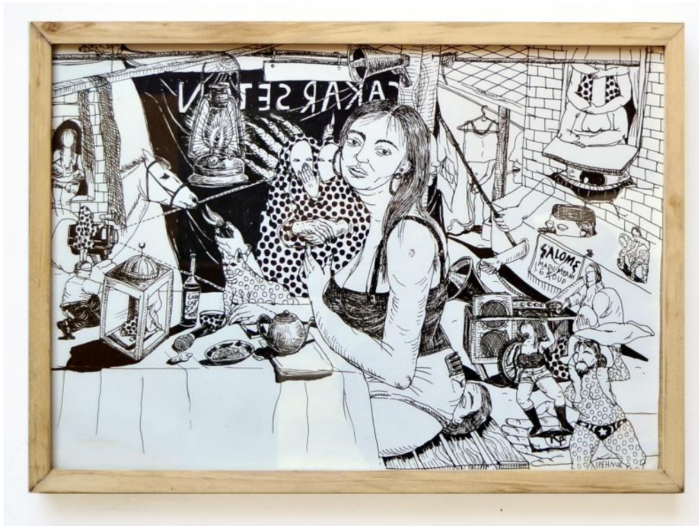
Salimah, 35 x 50 cm, 2015, Drawing pen on paper