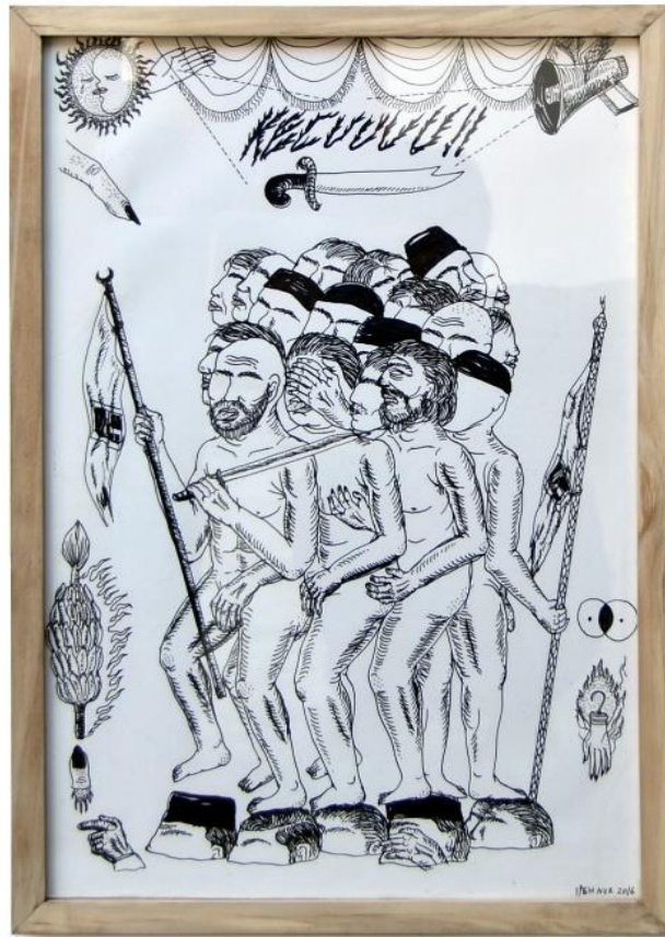
Ormas Kecu! , 35 x 50 cm, 2016, Drawing pen on paper