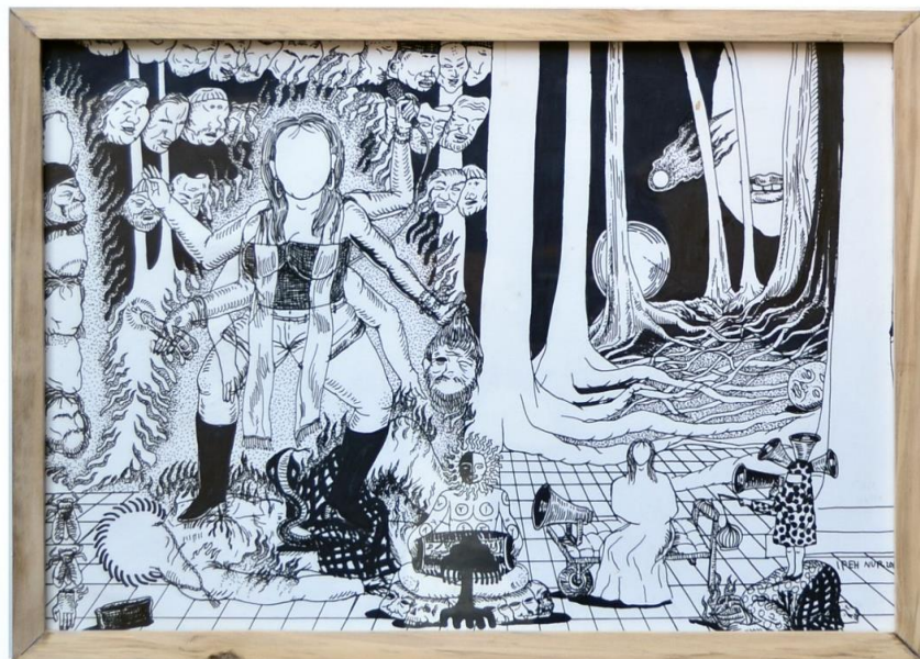
Darah Halal , 50 x 35cm, 2016, Drawing pen on paper