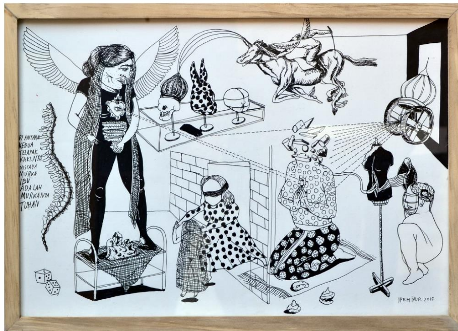
Gaun Hitam , 35 x 50 cm, 2016, Drawing pen on paper