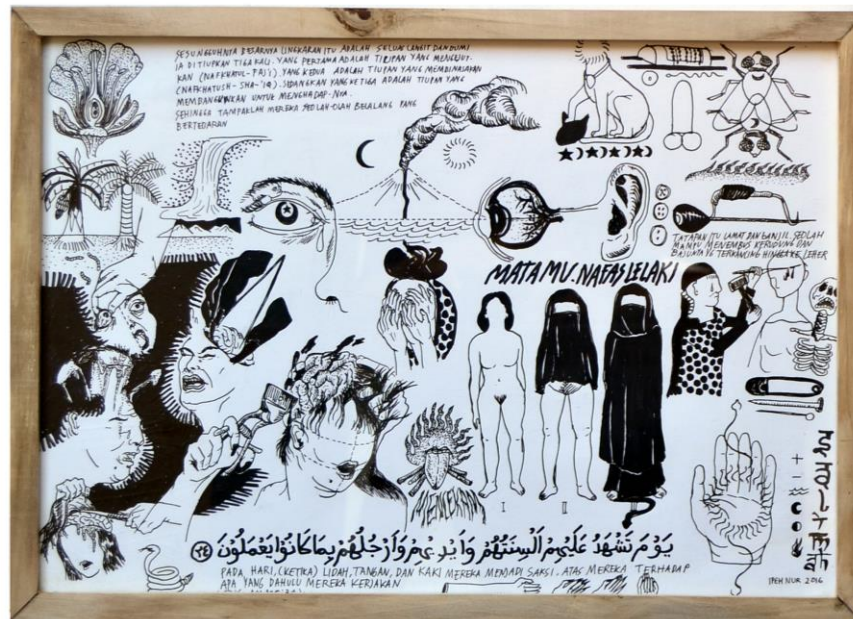
An-Nur; 24, 35 x 50 cm, 2016, Drawing pen on paper