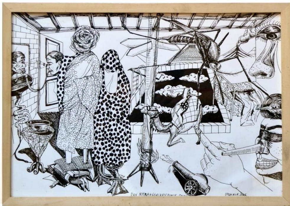
Punuk Unta , 35 x 50 cm, 2016, Drawing pen on paper