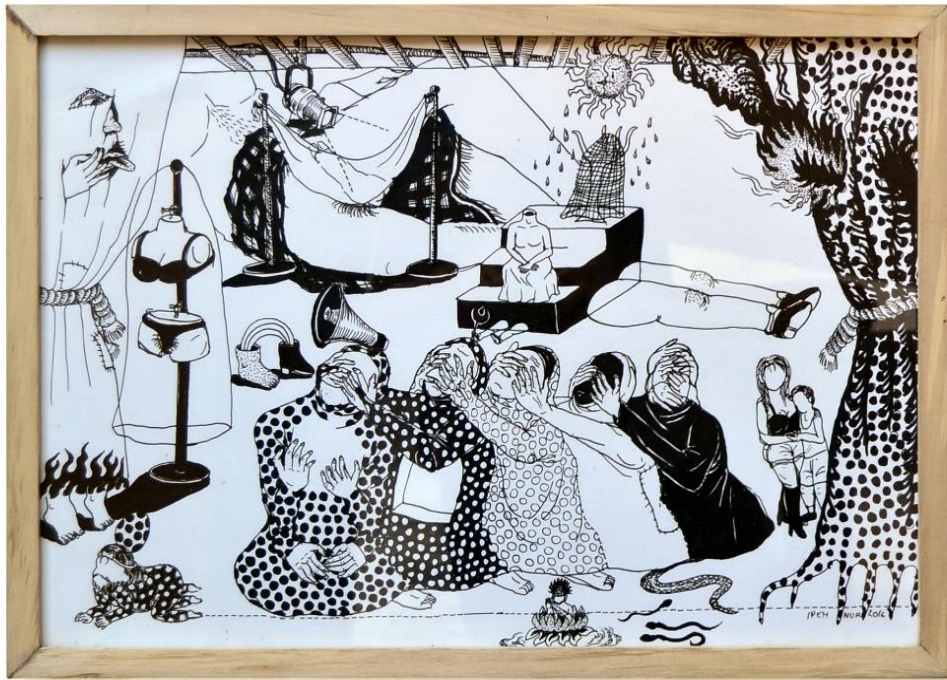
Kukutan , 35 x 50 cm, 2016, Drawing pen on paper