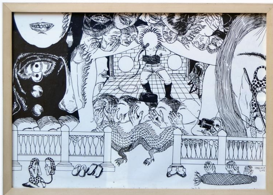
Panggung Salimah , 50 x 35cm, 2016, Drawing pen on paper