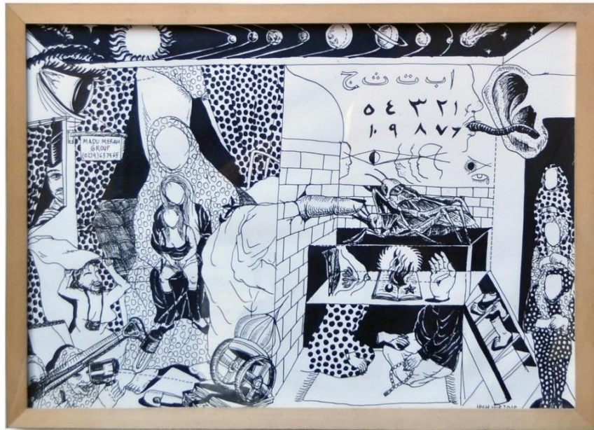
Bacalah! , 35 x 50 cm, 2016, Drawing pen on paper