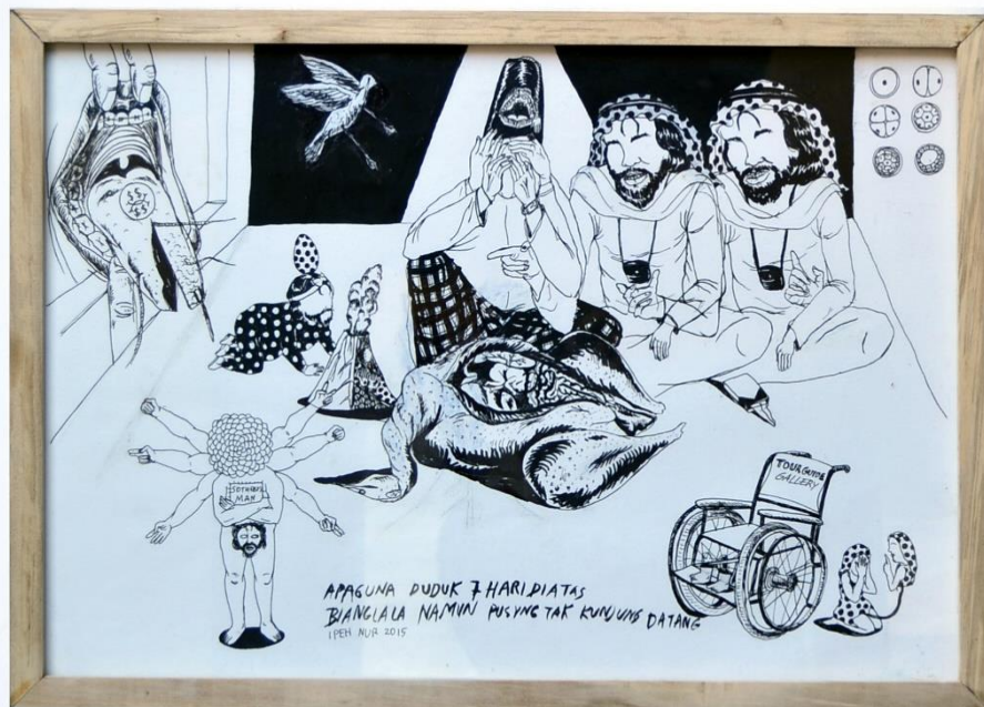
Kaum Puritan , 50 x 35cm, 2016, Drawing pen on paper